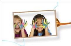
Multi-Input Touch Panels