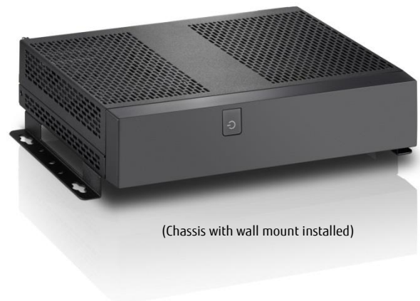
(Chassis with wall mount installed)