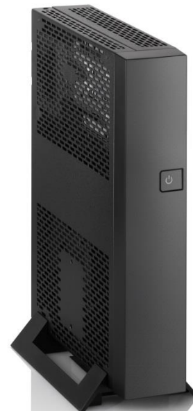
(Chassis with desk stand installed)